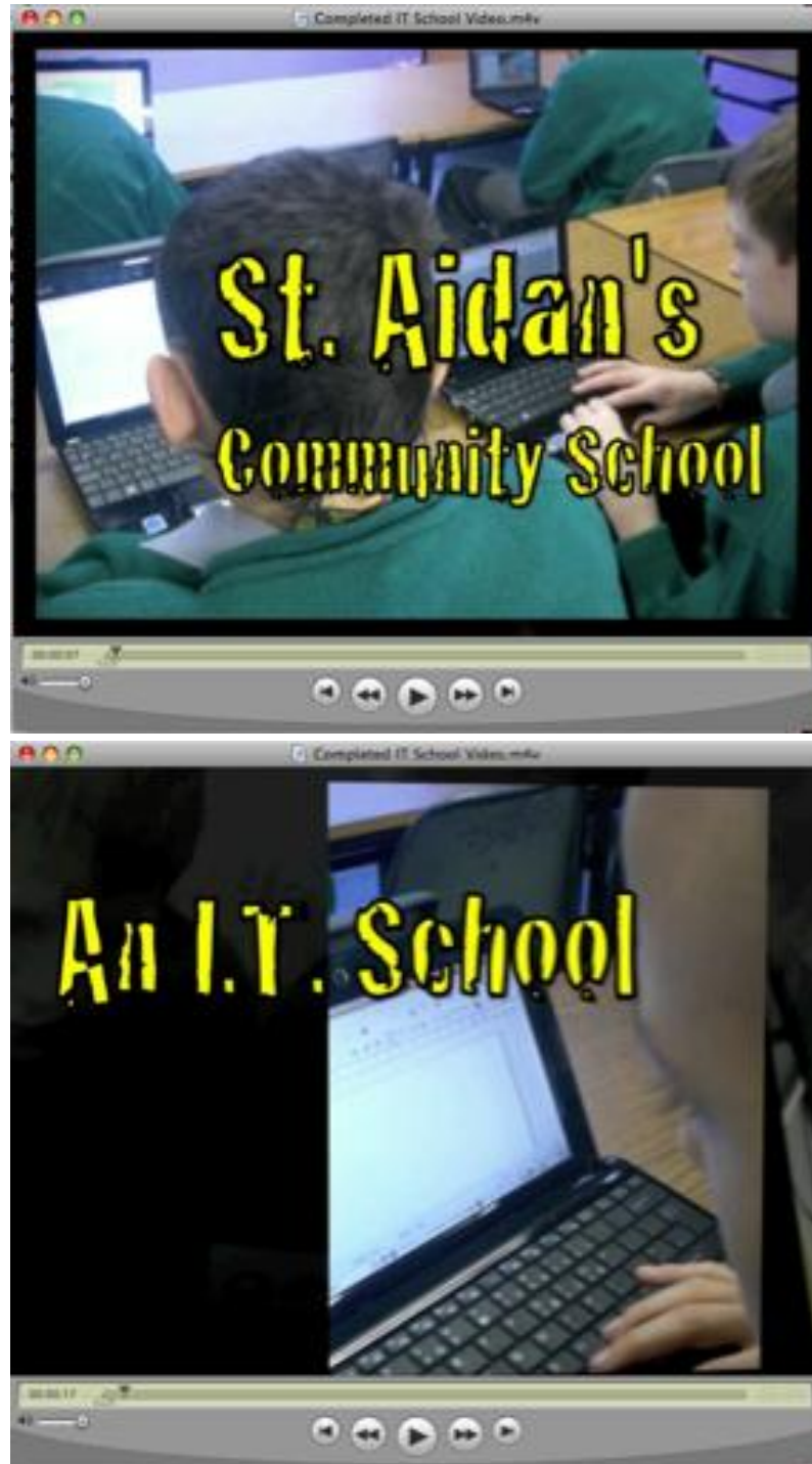
Video 1: St. Aidan's: An I.T. School

(Click here to view video/ copy and paste the link into your browser)